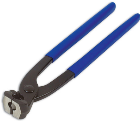
Hose Clip Pliers | 3881